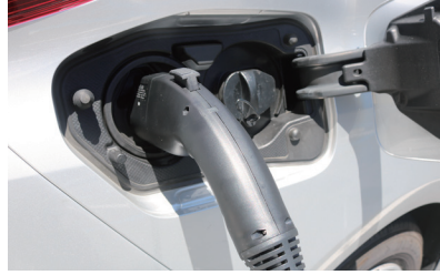
Electric Vehicle Charging Solution