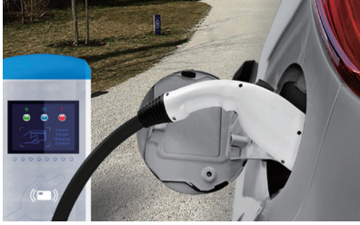
Public Charging Unit Application